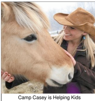
Camp Casey is Helping Kids